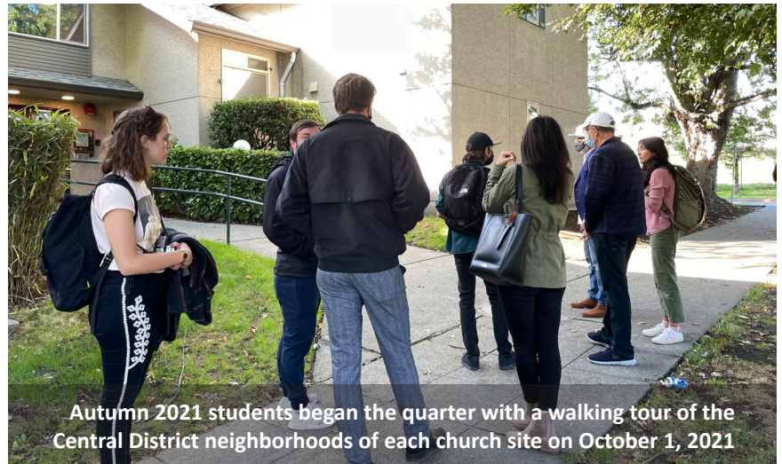
Autumn 2021 students began the quarter with a walking tour of the Central District neighborhoods of each church site on October 1, 2021